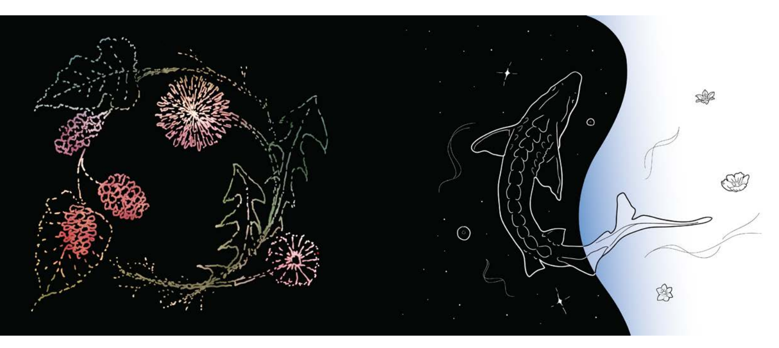
Image credit: Left: Amina Lalor, mulberries & dandelions , 2020, mixed media illustration. Courtesy of artist. Right: Dani Kastelein-Longlade, Relations , 2022, digital illustration. Courtesy of artists.